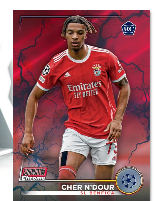
Base Card – Red/Orange Electric Charge Parallel