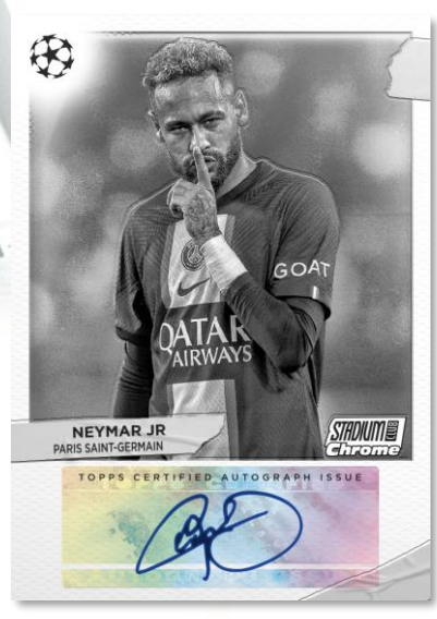
Behind the Lens Autograph